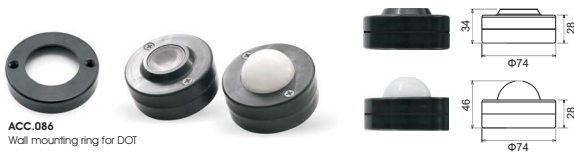
ACC.086 Wall mounting ring for DOT